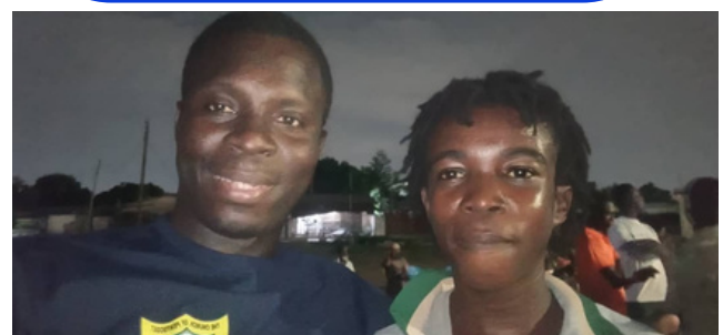
A new convert excited after accepting Jesus Christ