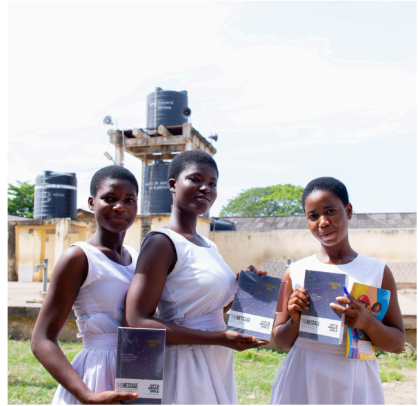
Donated Bibles for newly converted Students

On 10 th May 2025, The Great Commission Movement of Ghana undertook an outreach programme to Apam Senior High School in the Central Region of Ghana. The aim of the event was to reach out to the students with the Gospel of Salvation and give them the opportunity to make a commitment to Christ. In addition, there was a presentation on the topic: “The Media and The Youth Today”. This helped sensitize them on the dangers and usefulness of digital media. Packages comprising personal basic needs were offered to 400 needy students; 150 boys and 250 girls.