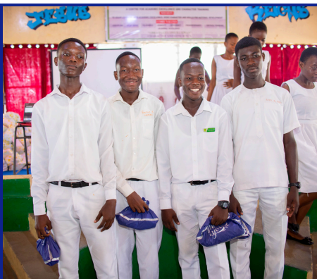
Spiritual Session: Sharing the Word of God

A short but powerful interlude of praises followed, after which the Word of God was shared . Sharing the story of the Prodigal son from the Bible, to students to realign themselves to God no matter the situation or current standing with God.